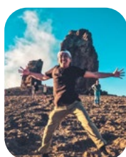
The Volcano Heart tour