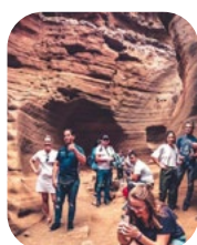
The Red Canyon tour