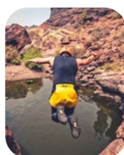
Canoying with jumps