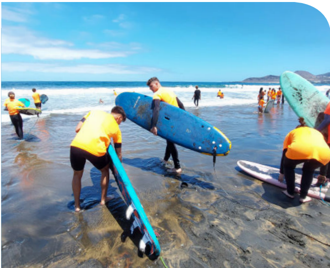
Surf at Las Canteras beach