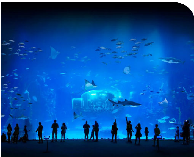
Poema del Mar Aquarium