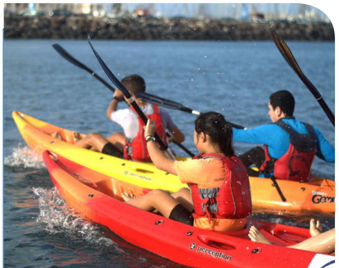
Kayak at Las Alcaravaneras beach